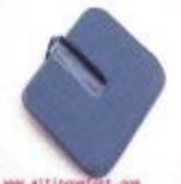
Coccyx Seat Support