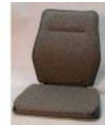
Foam Back Cushion