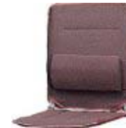
Standard Back Support