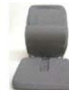
Padded and Coccyx Cut Out