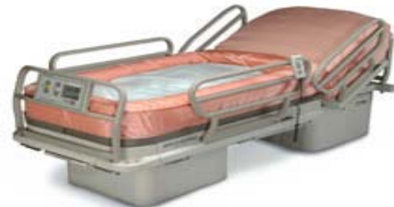
Clinitron At-Home AFT