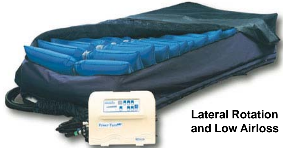
Lateral Rotation and Low Airloss