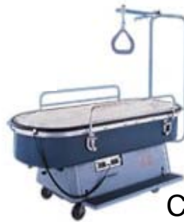
Clinitron II AFT