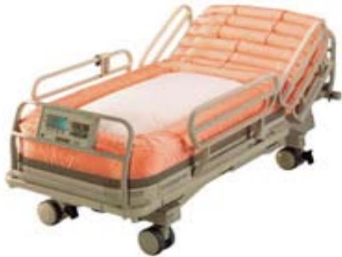
Clinitron Rite-Hite AFT

These support devices use a high flow rate of air to fluidize a fine particulate material, such as silicone ceramic glass beads, to produce a support medium that has characteristics very similar to liquid. This produces lower pressure between patient skin and the support medium by uniformly supporting the patient through air fluidization of glass beads or low-air-loss cushions.